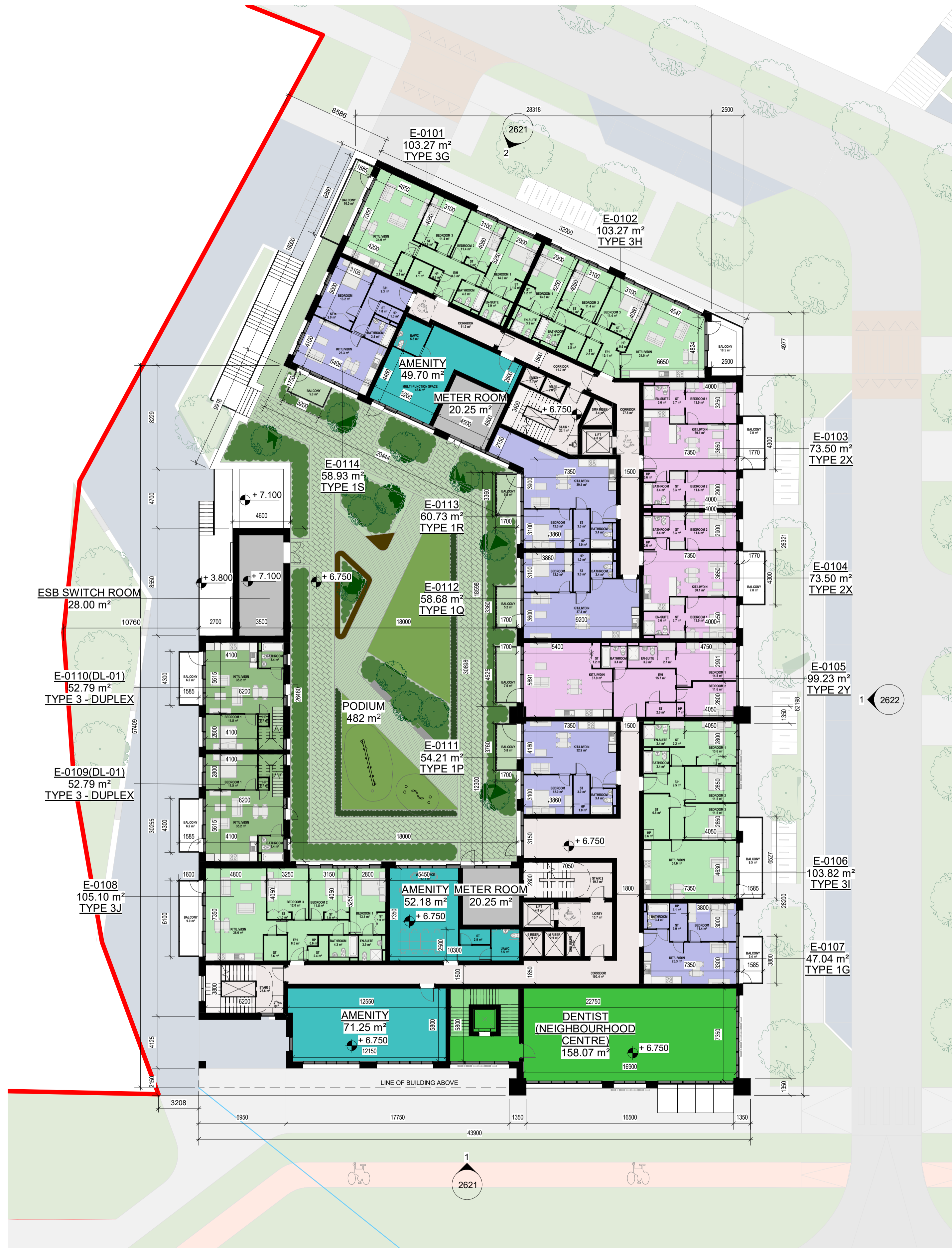
1 PLAN - BLOCK E - LEVEL 01 1 : 200

Please consider the environment before printing this sheet